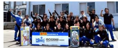
Kyorin Food Ind.Ltd. Fukusaki Factory