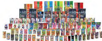
Hikari® brand - Total 700 items